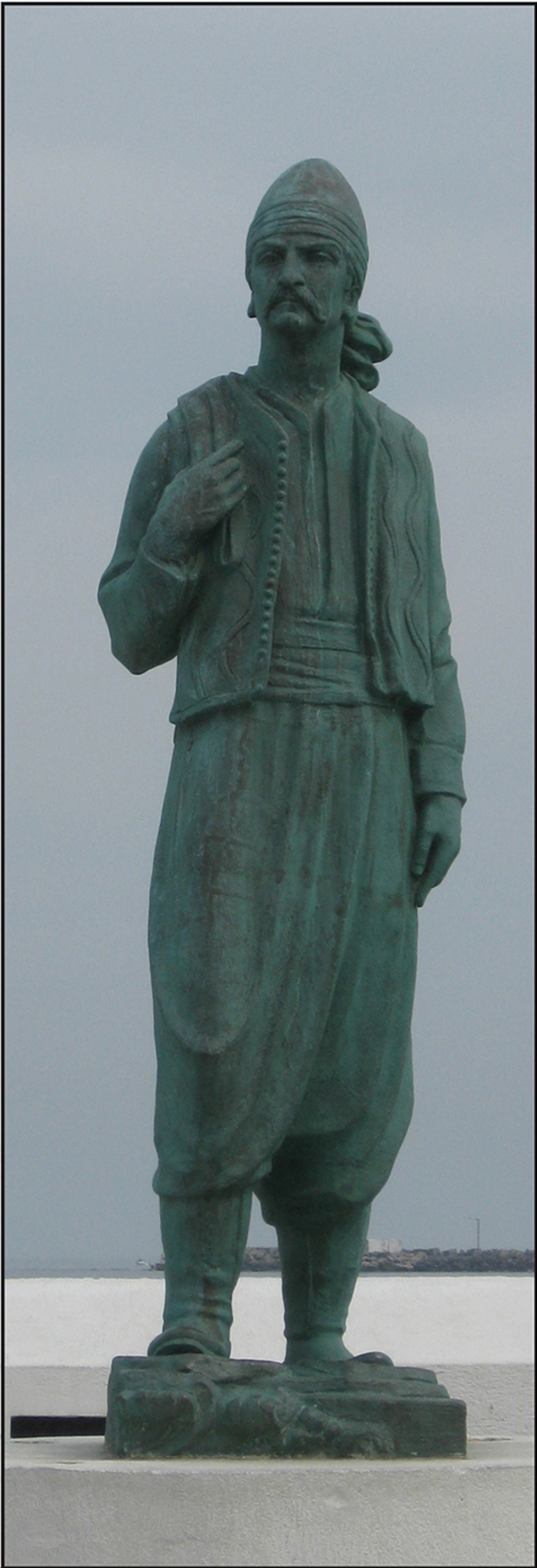
Statue of the lebanese immigrant all over the world