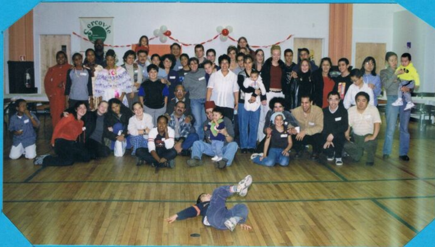
Photo souvenir de l'activité interculturelle regroupant 11 jeunes et 11 familles immigrantes. pour la préparation et la dégustation de repas. organisée par la Coalition sherbrookoise pour le travail de rue en collaboration avec le RIFE (Rencontre interculturelle des familles de l'Estrie), le 27 octobre 2001 dans les locaux de Sercovie à Sherbrooke.