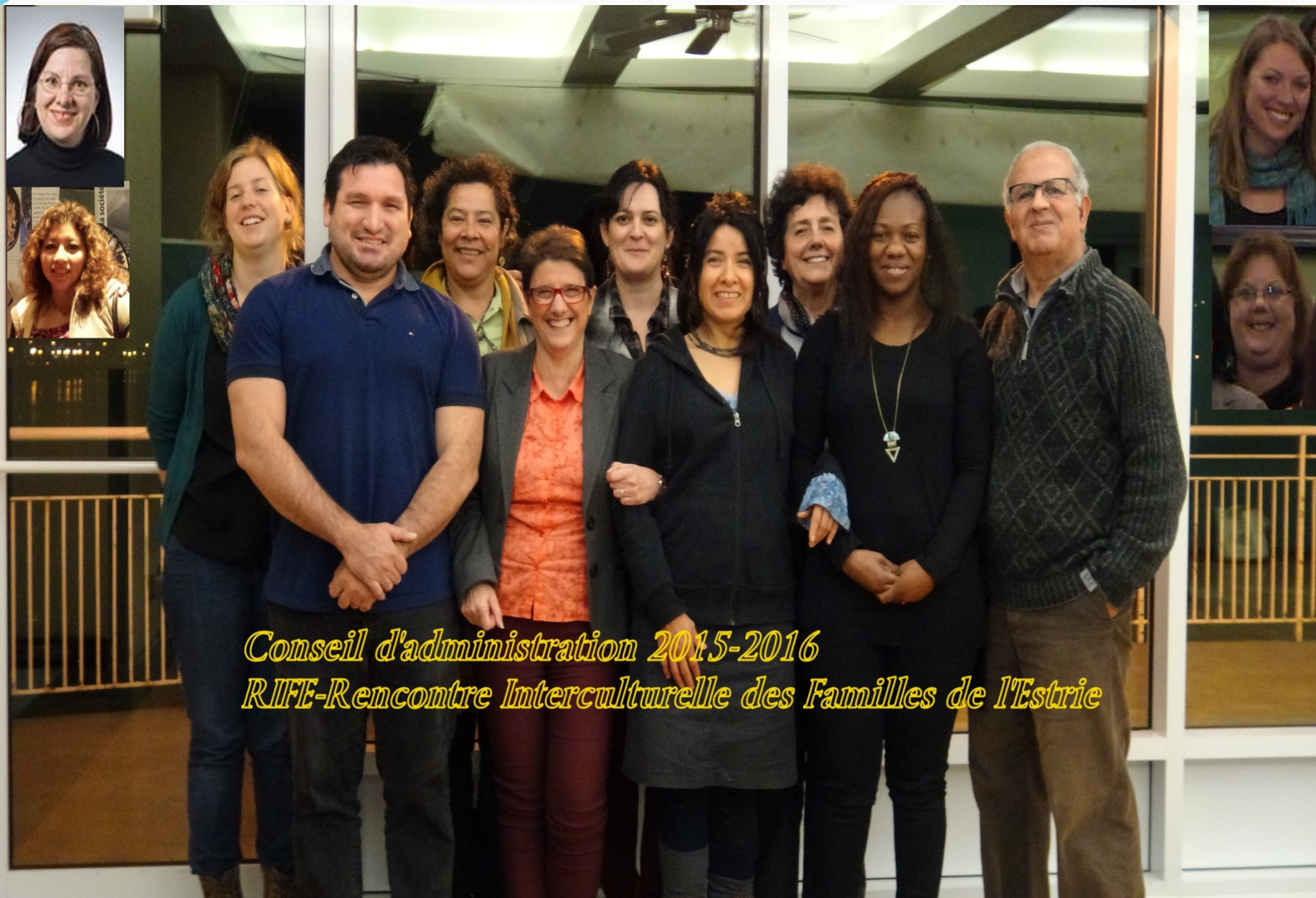
Conseil d'administration 2015-2016 RIFE-Rencontre Interculturelle des Familles de l'Estrie