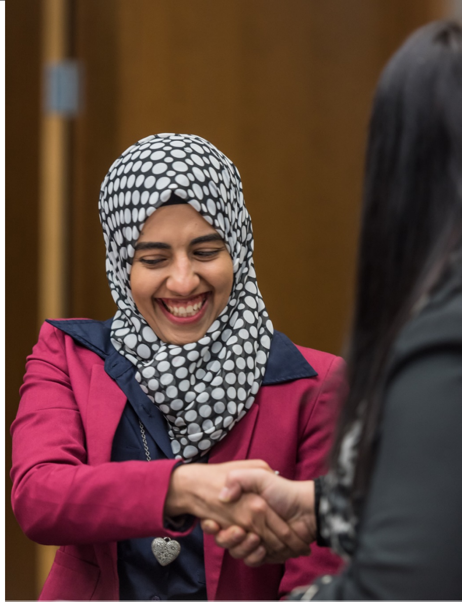
Members of the Surrey IAR at the first meeting