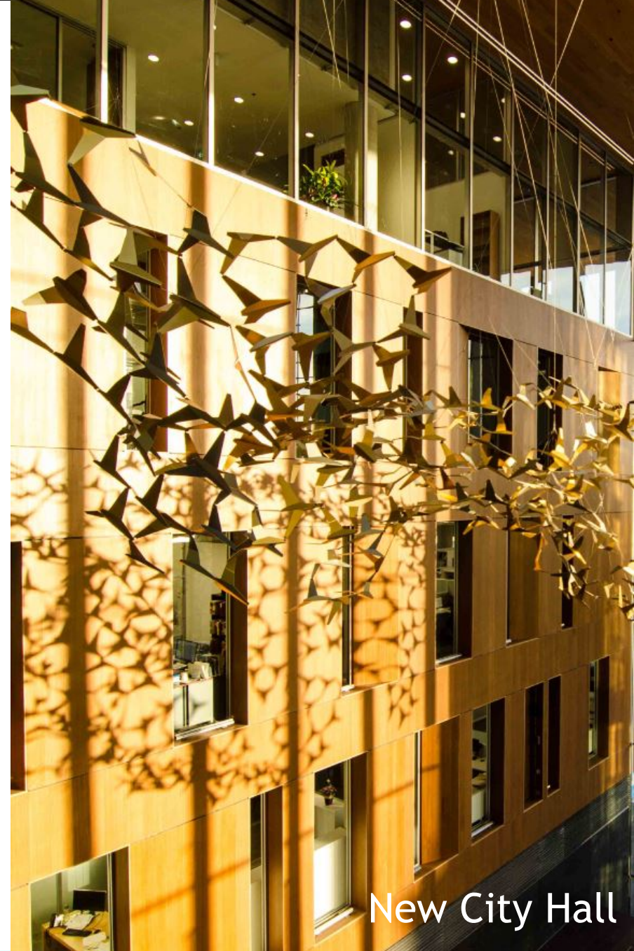
New City Hall