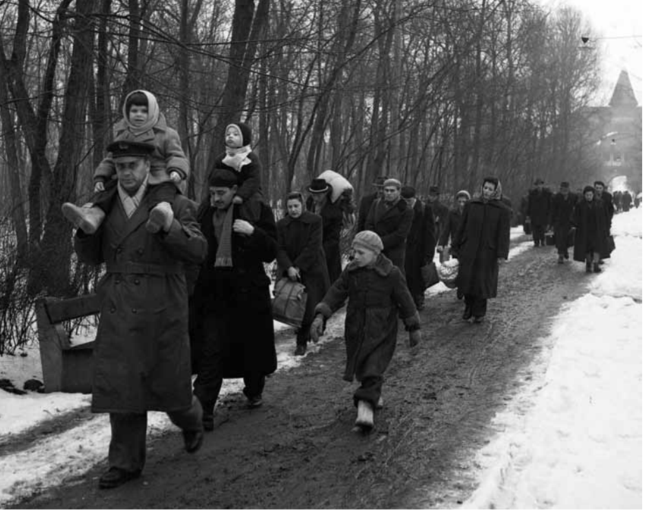
Hungarian Refugees Arrive in Yugoslavia 01 March 1957 Photo # 358004