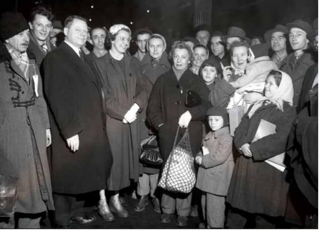
Arrival of Hungarians at Union Station, Ottawa, December 24, 1956.