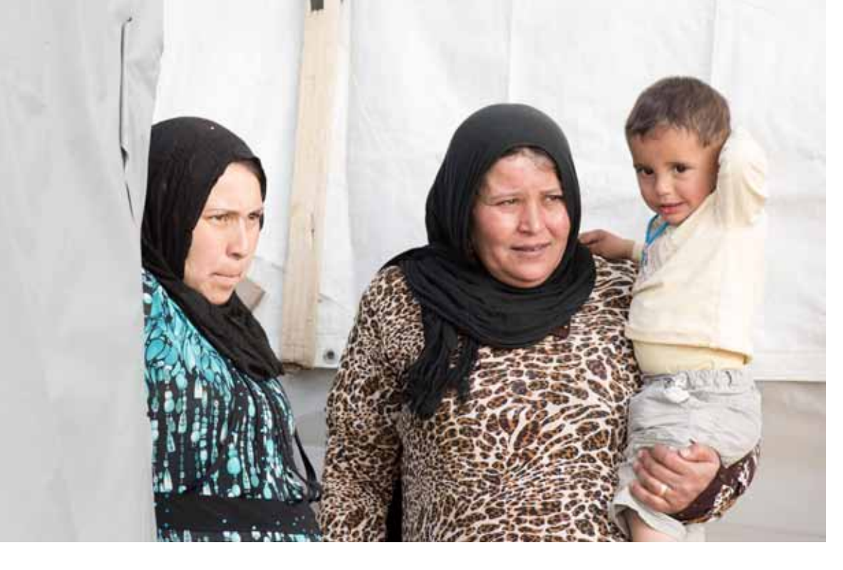
Syrian Refugee Settlement, Beqaa Valley, Lebanon. 25 March 2016. Beqaa Valley, Lebanon Photo # 668850

placed an extreme burden on refugees who came from states where there was no authority to issue or renew passports.