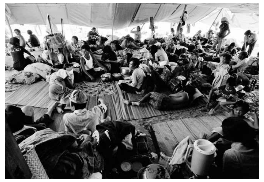
Vietnamese refugees living at the Songkhla refugee camp in Thailand. 01 July 1979 Thailand. Photo # 100465