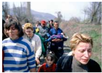
Kosovar refugees fleeing their homeland. 01 March 1999. Blace area, The former Yugoslav Republic of Macedonia Photo # 50810