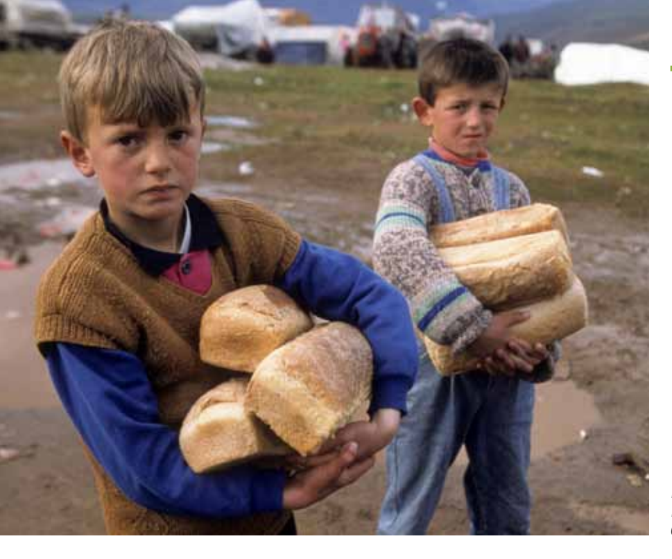
Kosovo Refugees Boys carrying their families' bread rations. 01 April 1999. Photo # 384472