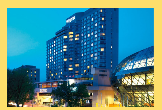
This year's conference will be held at the Westin Hotel in Ottawa

Registration is filling quickly and we encourage interested parties to register soon to avoid disappointment. To register for the preconference and the conference, please visit: