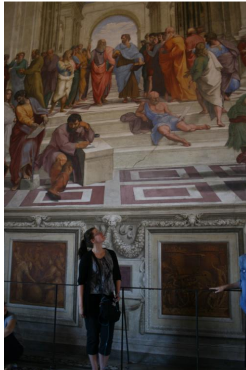
Bocconi University, Rome, Italy