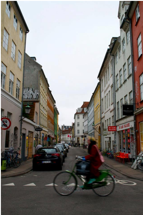
University of Copenhagen, Denmark

The ISS Student Exchange program has partnerships with over 50 universities in 20 countries