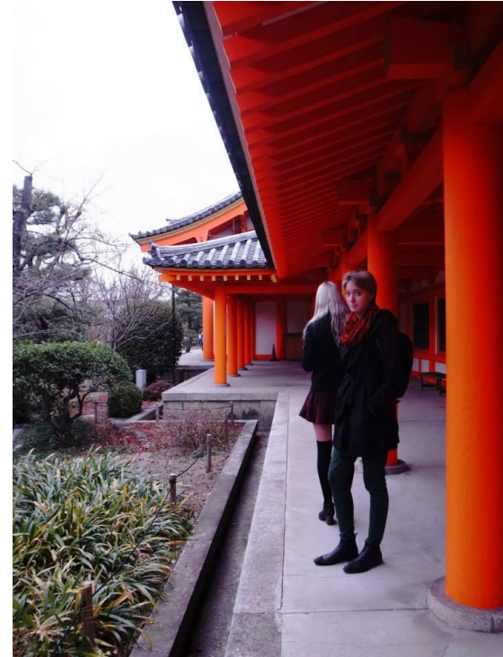
Doshisha Women's College, University of Victoria Kyoto, Japan