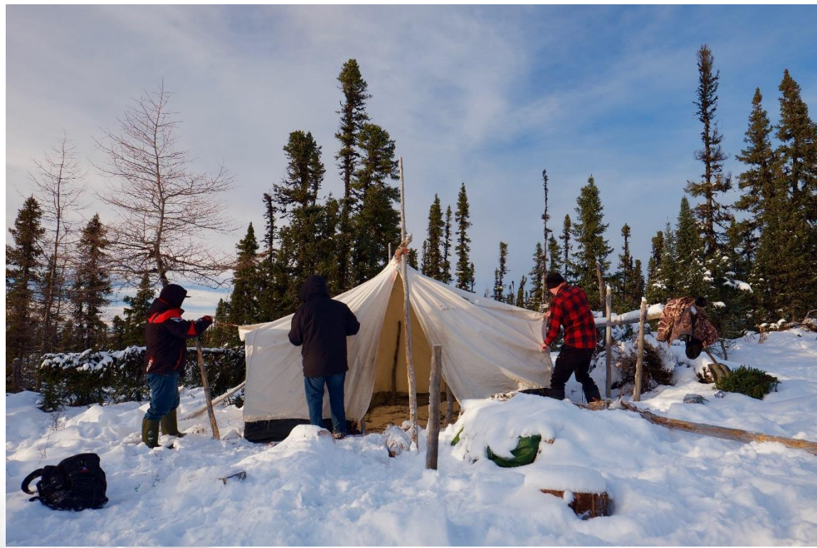
Deniz learning to pitch an Innu tent near Natuashish with local community members, winter 2018