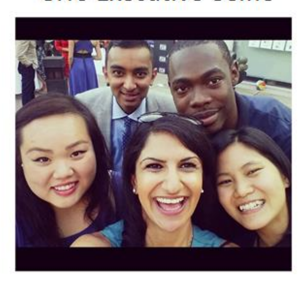
GHC Executive Selfie

Enabling international students and young immigrants to be fully aware of and have access to local opportunities to live, work, and play