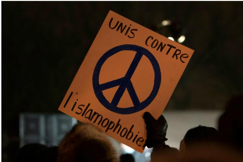
A person holds a sign reading "United against Islamophobia" during a rally near the Islamic Cultural Center in Quebec City, Canada, on Jan. 30, 2017.