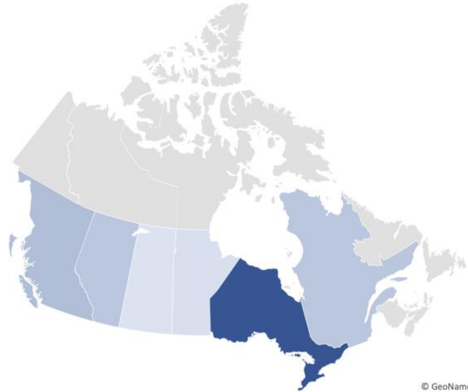
Ethnic Media Sources in Canada

Powered by Bing © GeoNames, HERE, MSFT, Microsoft